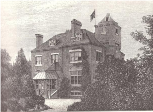
NORTHFIELD GRANGE, EAST-BOURNE: EXAMPLE OF AN OBSERVATORY BUILT AS PART OF A DWELLING-HOUSE.